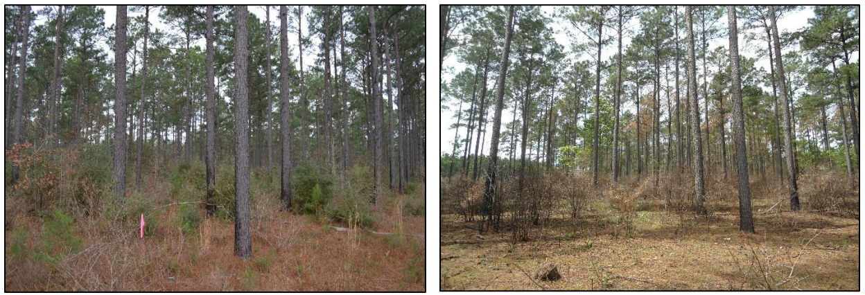
Mature loblolly pine stand, Trinity County, 119 acres.