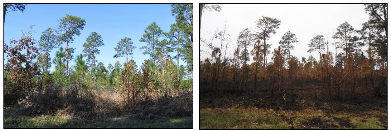
Mixed pine stand burned to promote longleaf pine, Houston County, 323 acres.