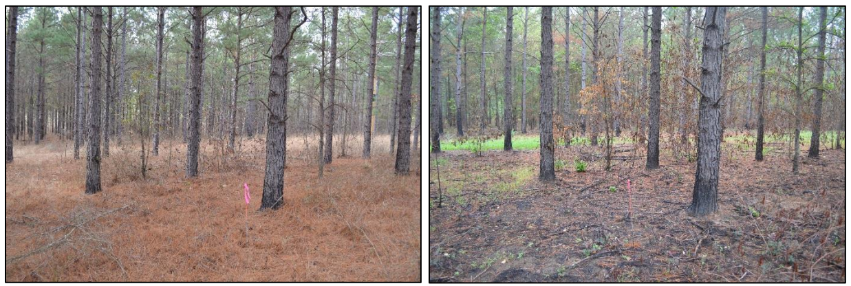
Mid-rotation loblolly pine stand, Harrison County, 379 acres.